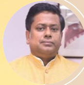
Dr. Sukanta Majumdar Union Minister of State for Education