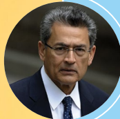
Rajat Gupta Indian-American Business Executive, Former CEO, McKinsey & Co.