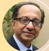
Prof. Kaushik Basu (Online) Professor, Cornell University