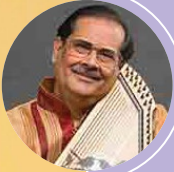
Pandit Ajoy Chakraborty Classical Vocalist Padma Bhushan Awardee