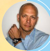
Dr. Tony Fadell American Engineer, Designer, Entrepreneur, and Investor