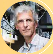
Prof. Wolfgang Ketterle (Online) Nobel Laureate in Physics from MIT, USA