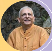
Sri M Spiritual Teacher, Social Reformer, Educationist